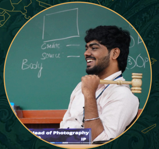
SANKRUSHI PS HEAD OF PHOTOGRAPHY