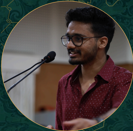
ADV. M VAIBHAV NATH CO- CHAIR

UNHRC UNITED NATIONS HUMAN RIGHTS COUNCIL