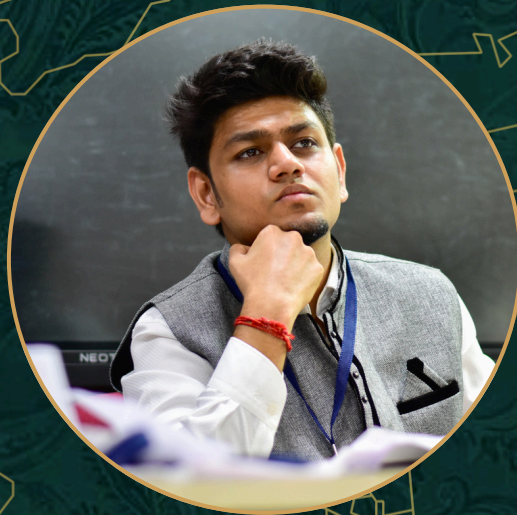
RAVIVATSAN PA MODERATOR