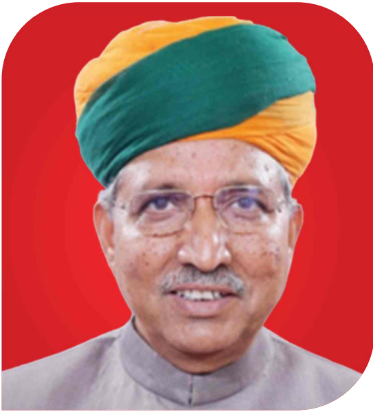
Shri. Arjun Ram Meghwal

Hon'ble Union Minister of State (I/C) for Law and Justice and Parliamentary Affairs, Government of India