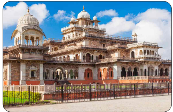
Albert Hall, Museum