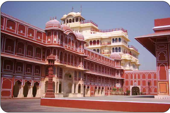
The City Palace