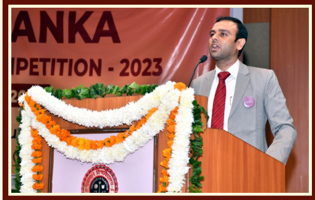
11 th UFYLC RANKA NMCC INAUGURATION