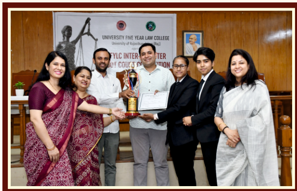
UFYLC ISMCC 2024