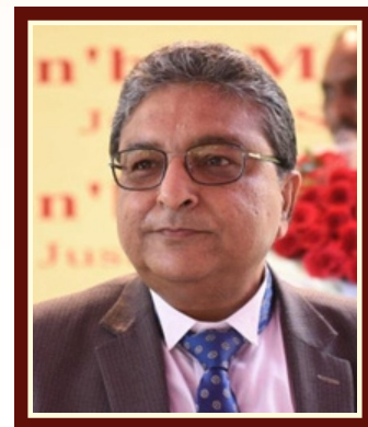
Hon'ble Mr. Justice Vineet Saran Former Judge, Supreme Court of India