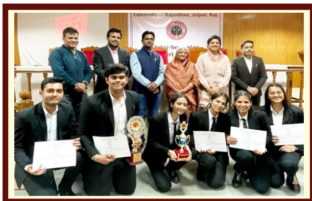
UFYLC ISMCC 2022