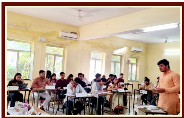
"YOUTH PARLIAMENT SAMVAAD-2023"