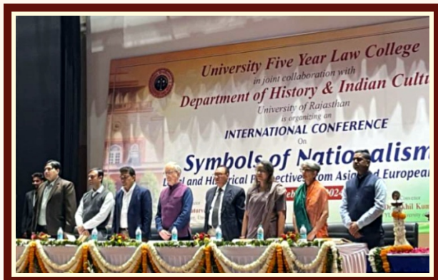
INTERNATIONAL CONFERENCE ON "SYMBOLS OF NATIONALISM"