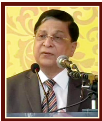
Hon'ble Mr. Justice Dipak Misra Former Chief Justice of India