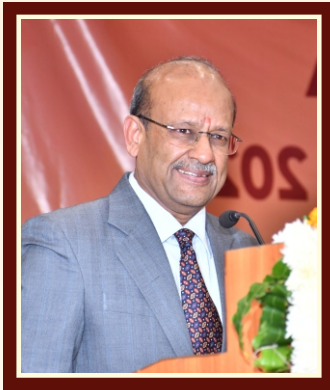
Hon'ble Mr. Justice Rajesh Bindal Supreme Court of India