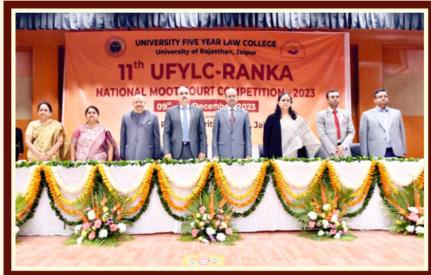
11 th UFYLC RANKA NMCC INAUGURATION