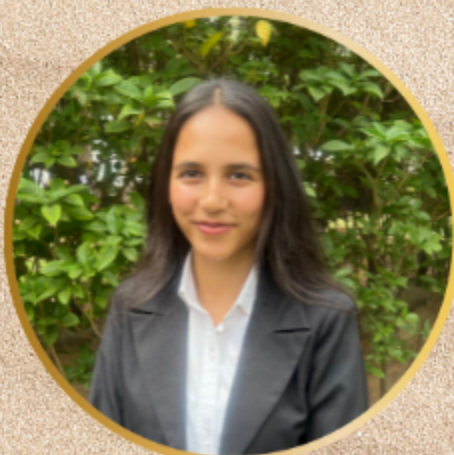
TISHA Chief Advisor +91 9667769932